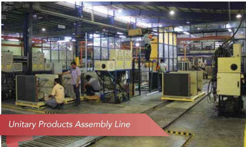
Unitary Products Assembly Line