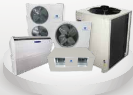
Mini Ducted Split Units