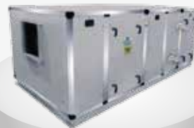
Air Handling Units