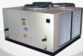
Air Cooled Condensing Units