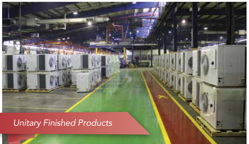
Unitary Finished Products