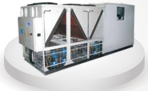
Packaged Air Conditioning Units