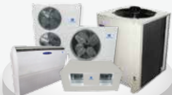
Mini / Ducted Split Units