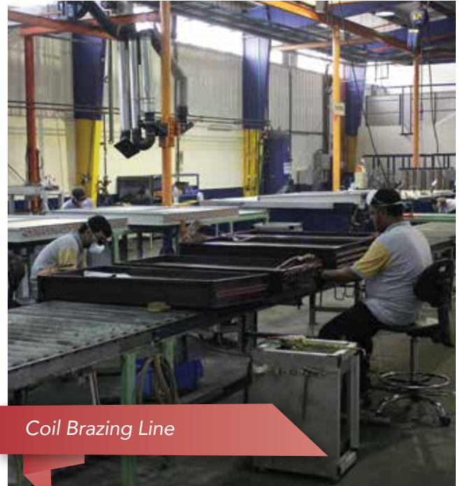
Coil Brazing Line