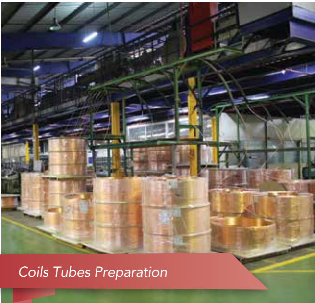
Coils Tubes Preparation