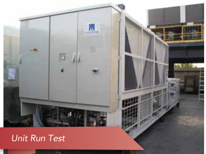
Unit Run Test

For any feedback / suggestions Please write to us at : Marketing.skm@skmaircon.com