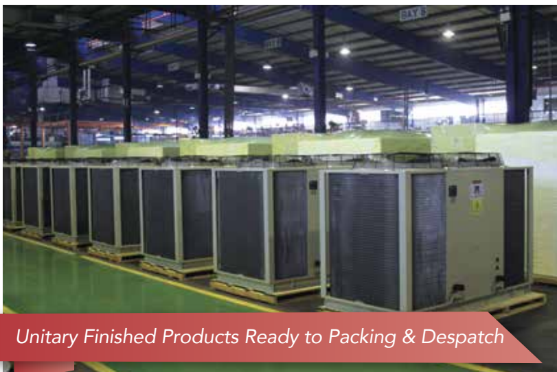
Unitary Finished Products Ready to Packing & Despatch