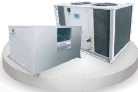
Ducted Split Units

ESMA Certification covers following SKM products: