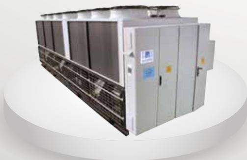
Air Cooled Water Chillers