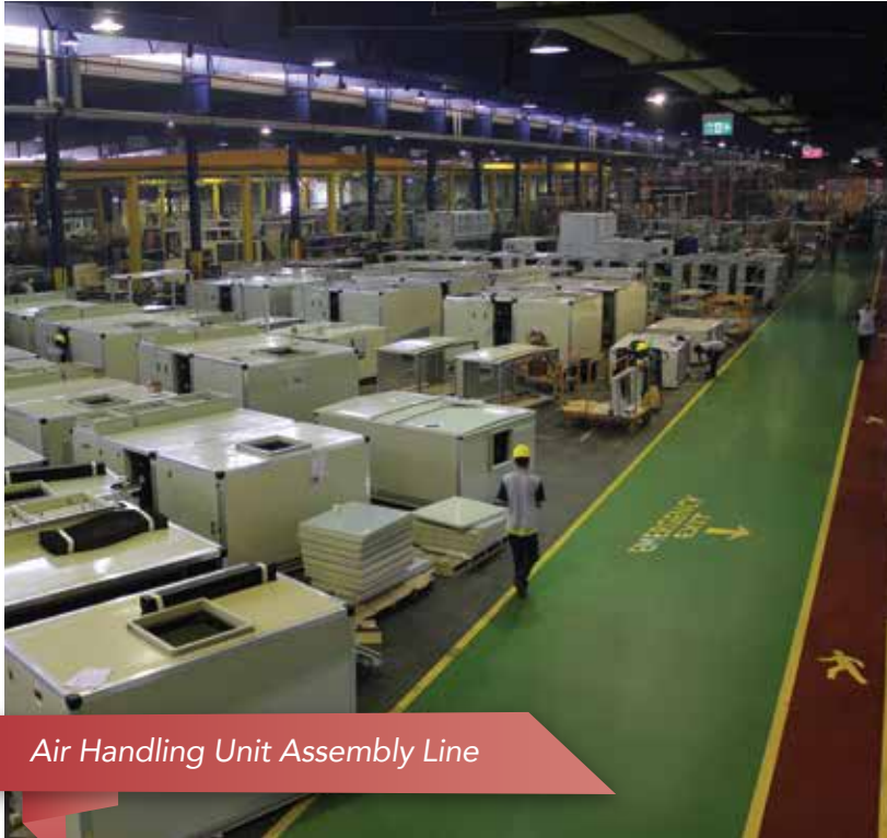
Air Handling Unit Assembly Line